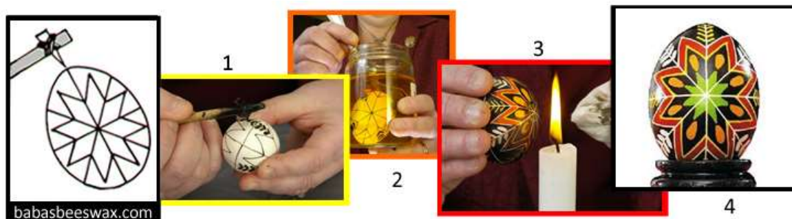
Everything you need to make beautiful pysanky the traditional way

Safety should be considered first and foremost when writing pysanky using a candle-heated kistka. Comply with all candle safety rules of the National Candle Association 1 , and use the following precautions and practices: