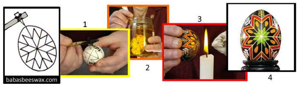
Everything you need to make beautiful pysanky the traditional way

Safety should be considered first and foremost when writing pysanky using a candle-heated kistka. Comply with all candle safety rules of the National Candle Association <sup>1</sup>, and use the following precautions and practices: